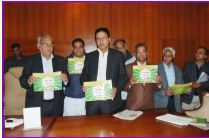
Hon'ble Chief Minister, Haryana, Sh. Bhupinder Singh Hooda released the Resource Atlas of Rohtak district at Chandigarh

Haryana Space Applications Centre (HARSAC), Hisar of Department of Science and Technology, Haryana, has embarked upon an ambitious project on GIS based resources and infrastructure mapping in the State. Project envisages creation of digital databases for each district on 1:50,000 scale for the rural areas and 1:2,000 scale for the urban areas. The database to be created under the project would include linear features (roads, railway lines, canals/drainage network, settlement locations), administrative boundaries (state, district, tehsil, block, village, assembly and parliamentary constituencies, police station jurisdiction etc.), natural resource maps like water bodies, forests/ plantations, land use/ land cover, soils, geology/ geo-morphology, wastelands, cropping patterns, crop rotations, ground water prospects, land degradation, etc.), GPS locations of government infrastructure and facilities in all the villages and marking on the base maps the basic urban amenities, major land marks, institutions, facilities, govt offices etc for each town (schools, colleges, technical, vocational institutions, health centres, veterinary hospitals, police stations, water supply schemes, bus stands, railway stations, mini secretariats, judicial complexes, power houses) and census data (households, population, SC population, sex ratio, literacy rate, number of voters, etc.). A sum of Rs. 298 lacs have been sanctioned to HARSAC by Government of Haryana for taking up this project.