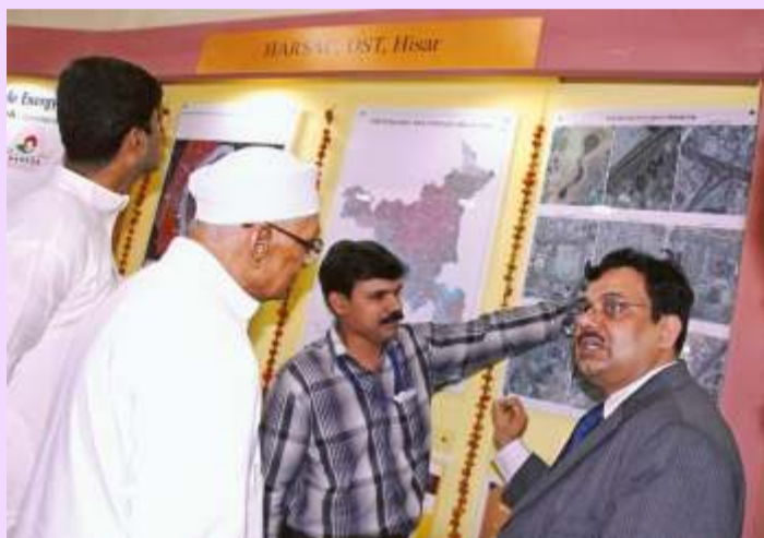
Hon.'able Governor Sh. Jagannath Pahariya viewing the HARSAC activities in Haryana Pavilion in IITF-2009, Pragati Maidan, New Delhi on 17.11.2009.