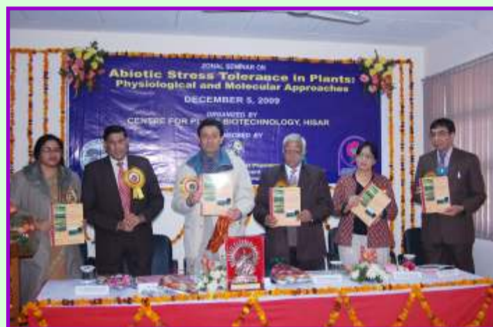
Zonal Seminar organized at CPB on 5 th December, 2009