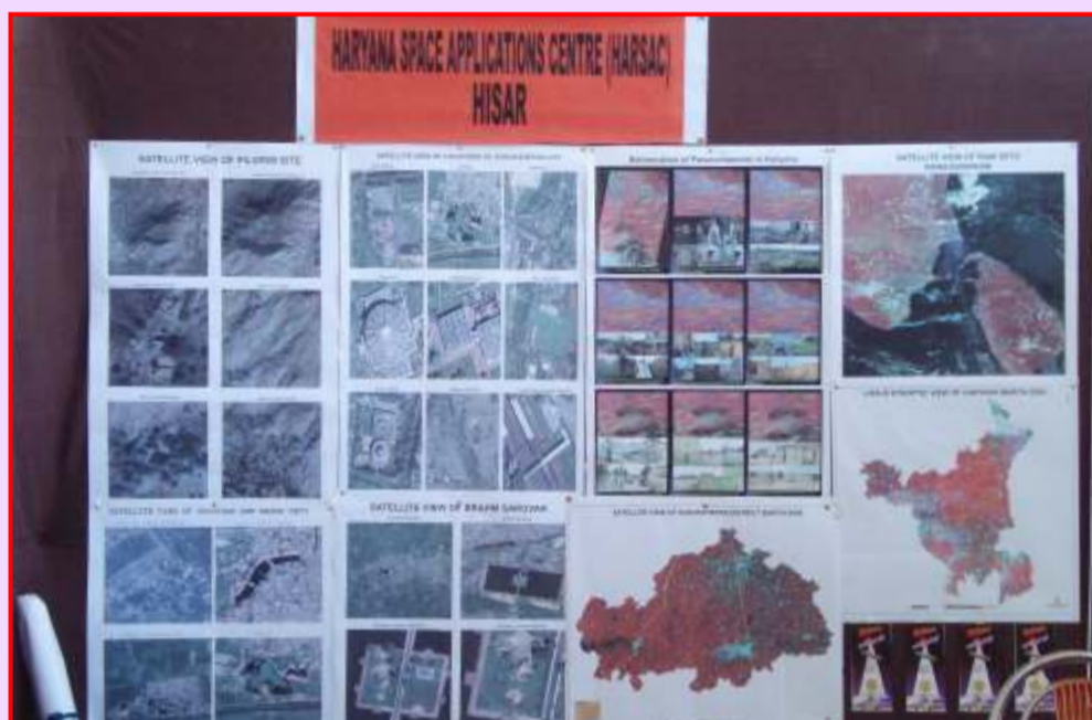
View of HARSAC Stall in Geeta Jayanti Mahotsav at Kurukshetra on 24 th to 28 th November, 2009.