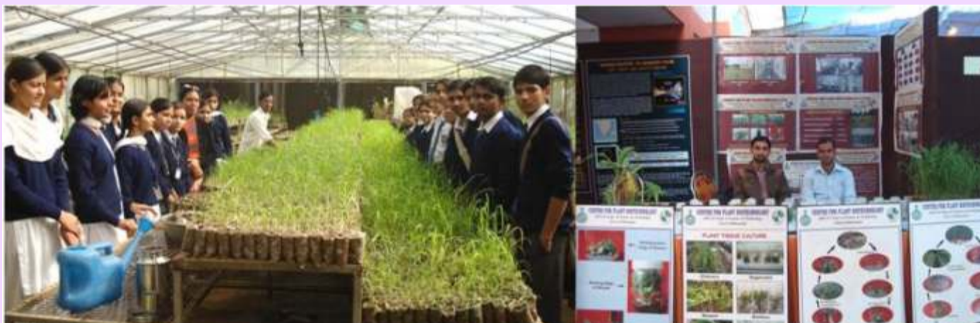
Students from Senior Model School, Hisar at CPB