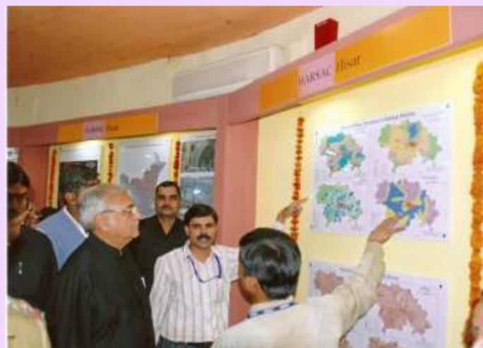
Hon.'able Chief Minister Sh. Bhupinder Singh Hooda viewing the HARSAC activities in Haryana Pavilion in IITF-2009, Pragati Maidan, New Delhi on 15.11.2009.